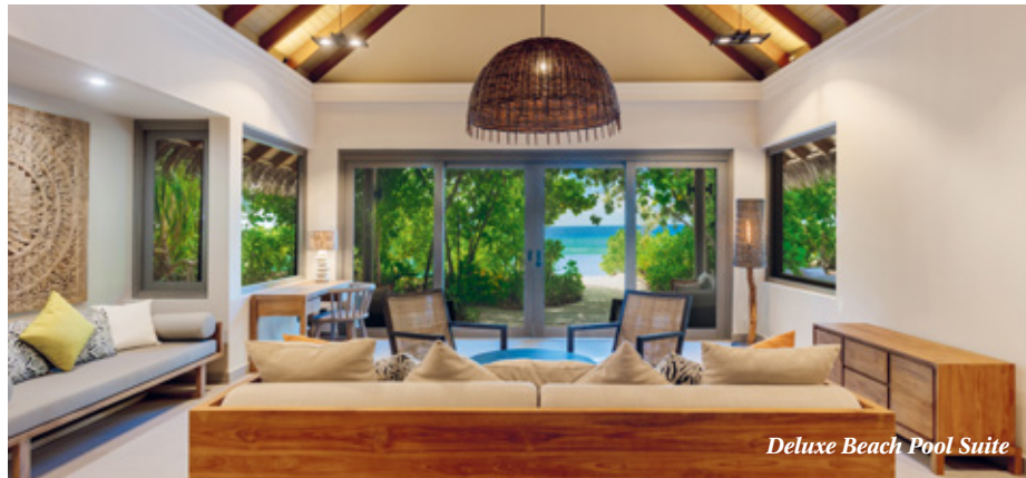
Deluxe Beach Pool Suite