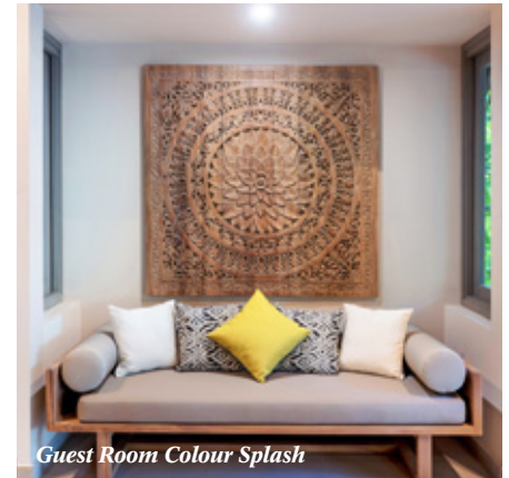
Guest Room Colour Splash