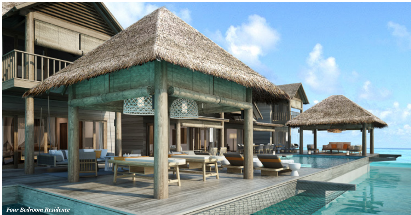
Four Bedroom Residence

During your rejuvenate stay at Vakkaru Luxury Resort, you can enjoy the following features that accompany each of our villas & suites: