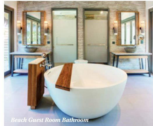
Beach Guest Room Bathroom

Whether you are travelling as a couple on a romantic break, or in a larger group with family and friends, the resort offers a superlative choice of accommodation types.